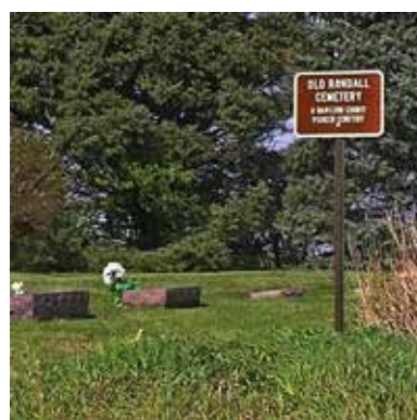
OLD RANDALL CEMETERY

Was also known as Webster Township or Bell Cemetery. It is located in section 8 of Webster Township. GPS Coordinates: Latitude: 42.36810 \Longitude: -93.90890