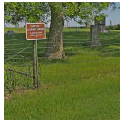
CLEAR LAKE, ELLSWORTH CEMETERY**

Was also known as Christytown or Olson Cemetery. It is located in section 36 of Ellsworth Township. GPS Coordinates: Latitude: 42.22020 \Longitude: -93.58680