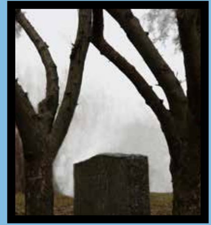
= Hamilton County, Iowa =

Celebrating Our Heritage Rich in Tradition Rooted in History